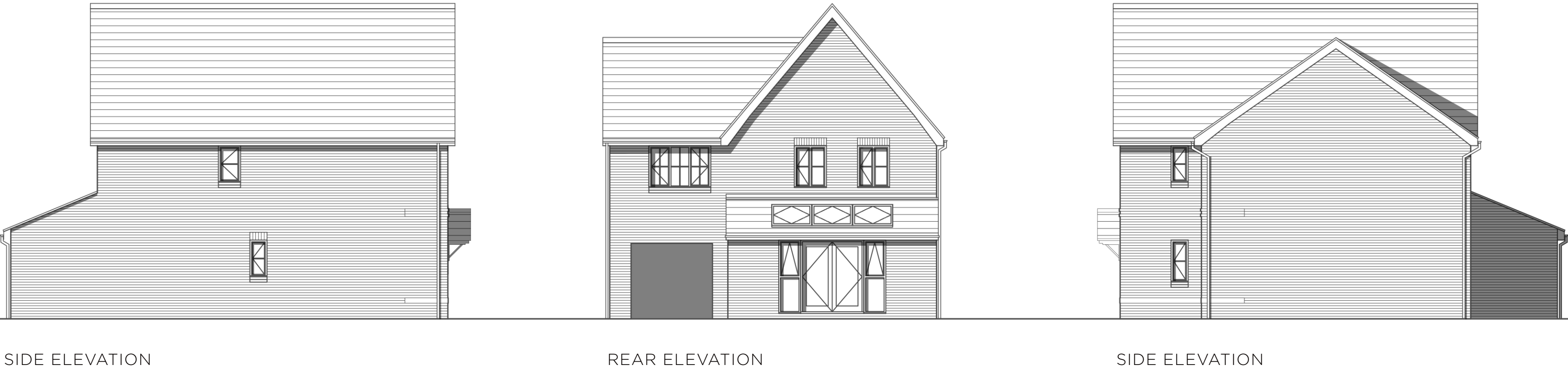
1:100 0m 1m 3m 6m AS PROPOSED ELEVATIONS