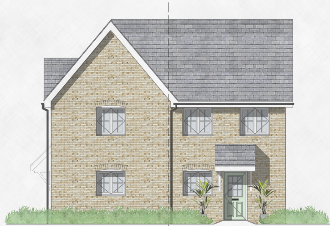
FRONT ELEVATION HANDED