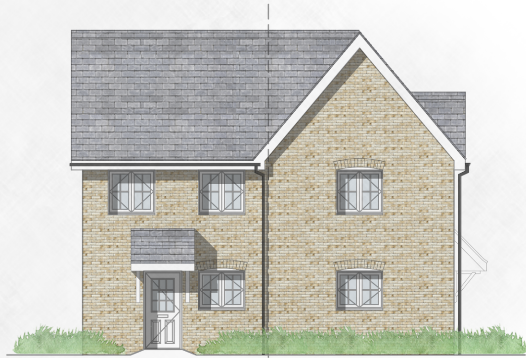
FRONT ELEVATION AS