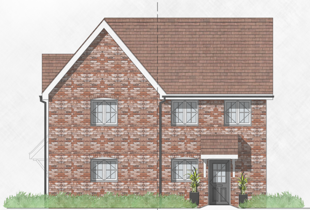
FRONT ELEVATION HANDED