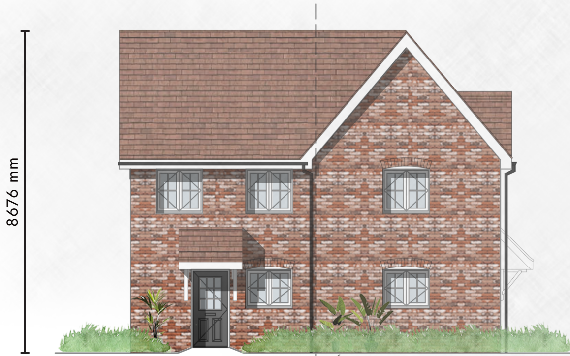
FRONT ELEVATION AS