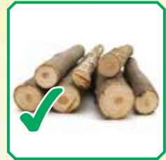
Logs & branches