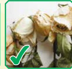
Dead flowers & house plants