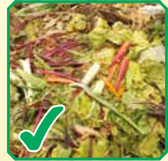
Perished vegetables from garden (not vegetable peelings)