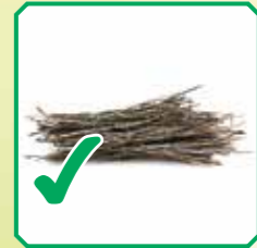
Twigs & hedge trimmings