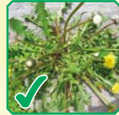
Old garden plants & weeds