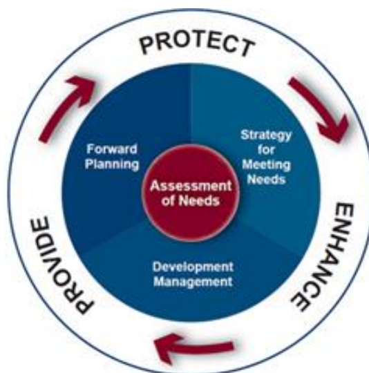
Figure 2.1: Sport England themes

To provide new outdoor sports facilities where there is current or future demand to do so.